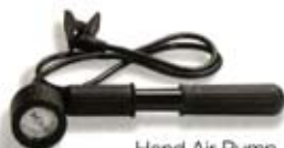
Hand Air Pump